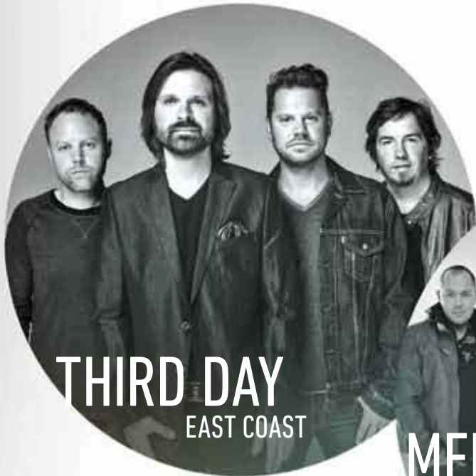
THIRD DAY EAST COAST