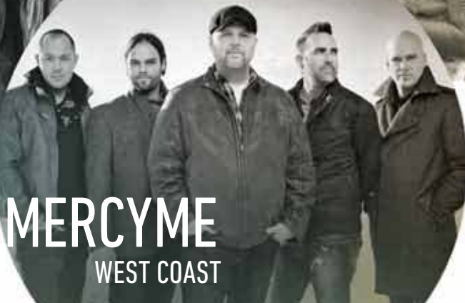
MERCYME WEST COAST